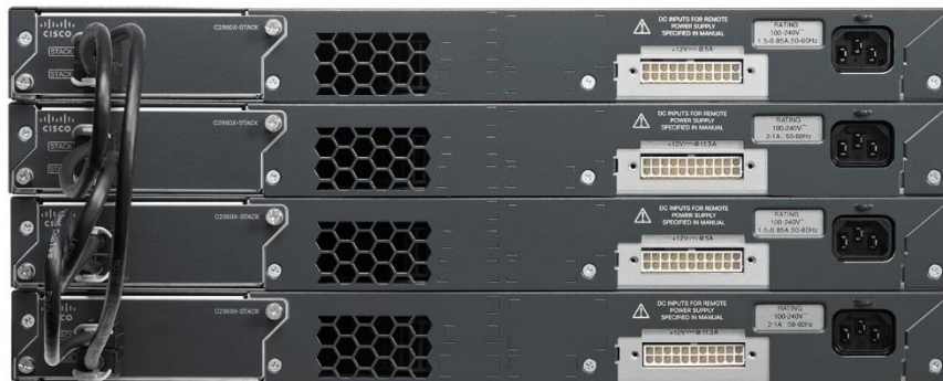
Figure 5. Cisco FlexStack-Plus switch stack