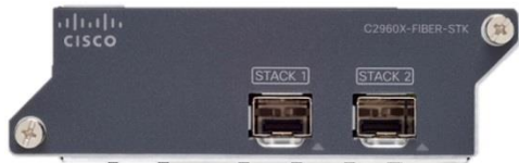
Figure 7. Cisco FlexStack-Extended: Fiber module