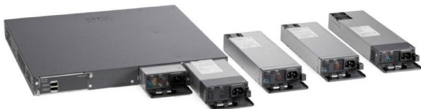
Figure 2. Cisco Catalyst 2960-XR Series power supply

Dual redundant power supplies are supported on the Cisco Catalyst 2960-XR Series Switches. These switches ship with one power supply by default. The second power supply can be purchased at the time of ordering the switch or as a spare. These power supplies have built-in fans to provide cooling (Figure 2).